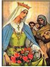
ST. ELIZABETH OF HUNGARY

For political reasons, the marriage of Elizabeth of Hungary was arranged shortly after she was born. The future husband chosen for her was Louis, a German prince. When she was four years old she was taken to live in Wartburg Castle to be raised by Louis's family. Some of them didn't care for her because she was so concerned about others and so pious. They tried to talk Louis into sending her back to Hungary, but he refused.